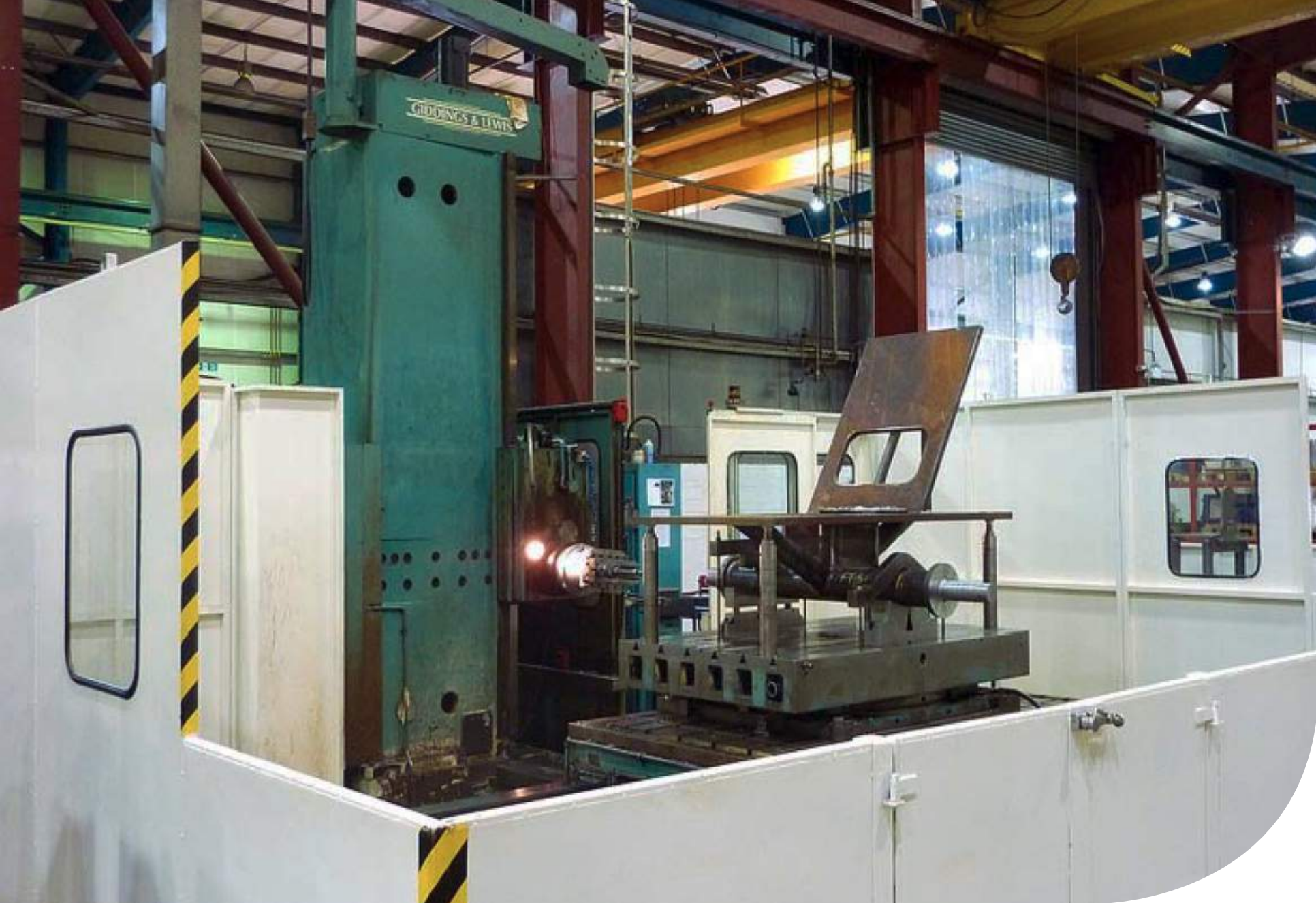
G50-2 | Horizontal Borer Large