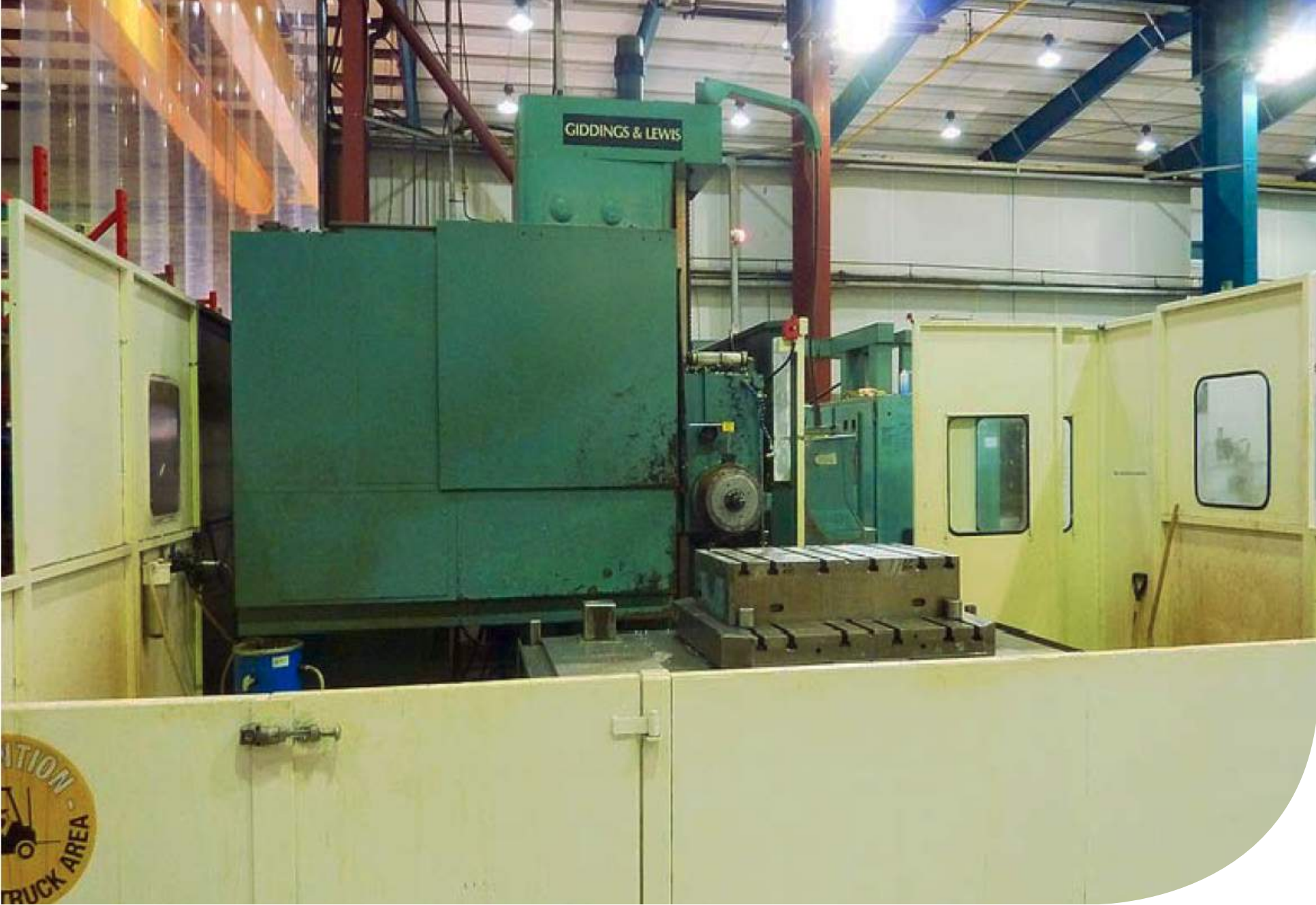
RTX-2 | Horizontal Borer Medium