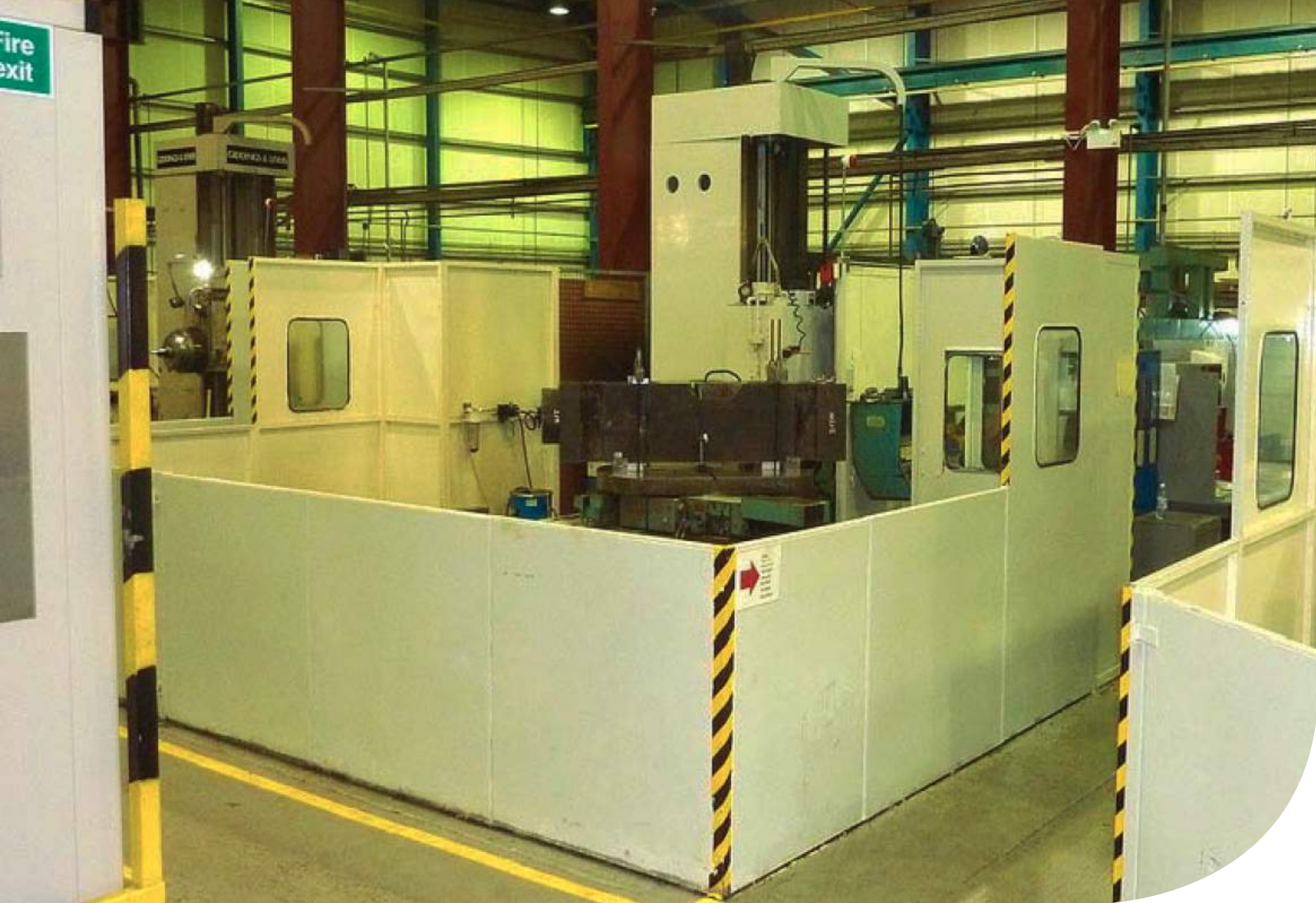
G40-T | Horizontal Borer Medium