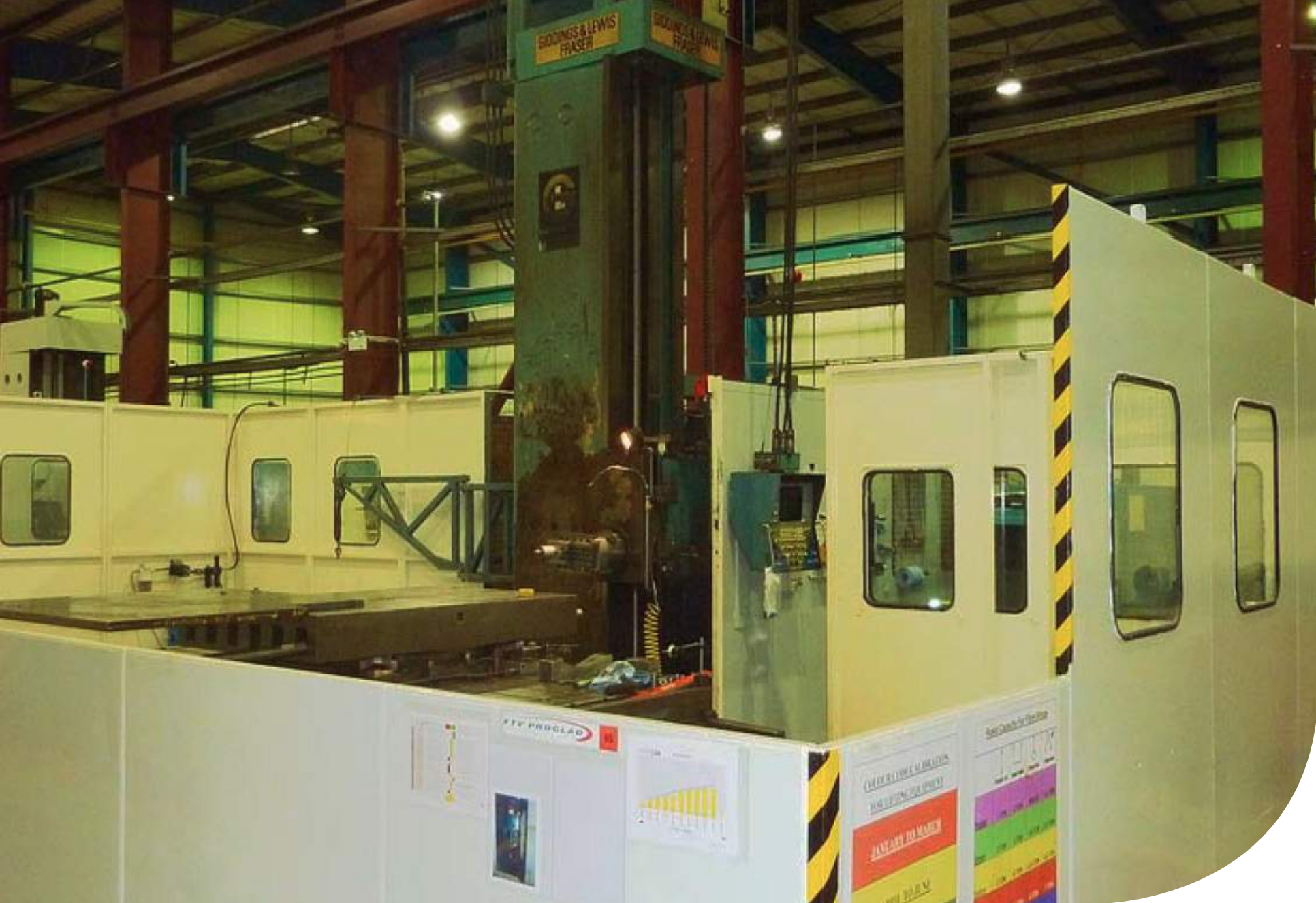
G60-1 | Horizontal Borer Large