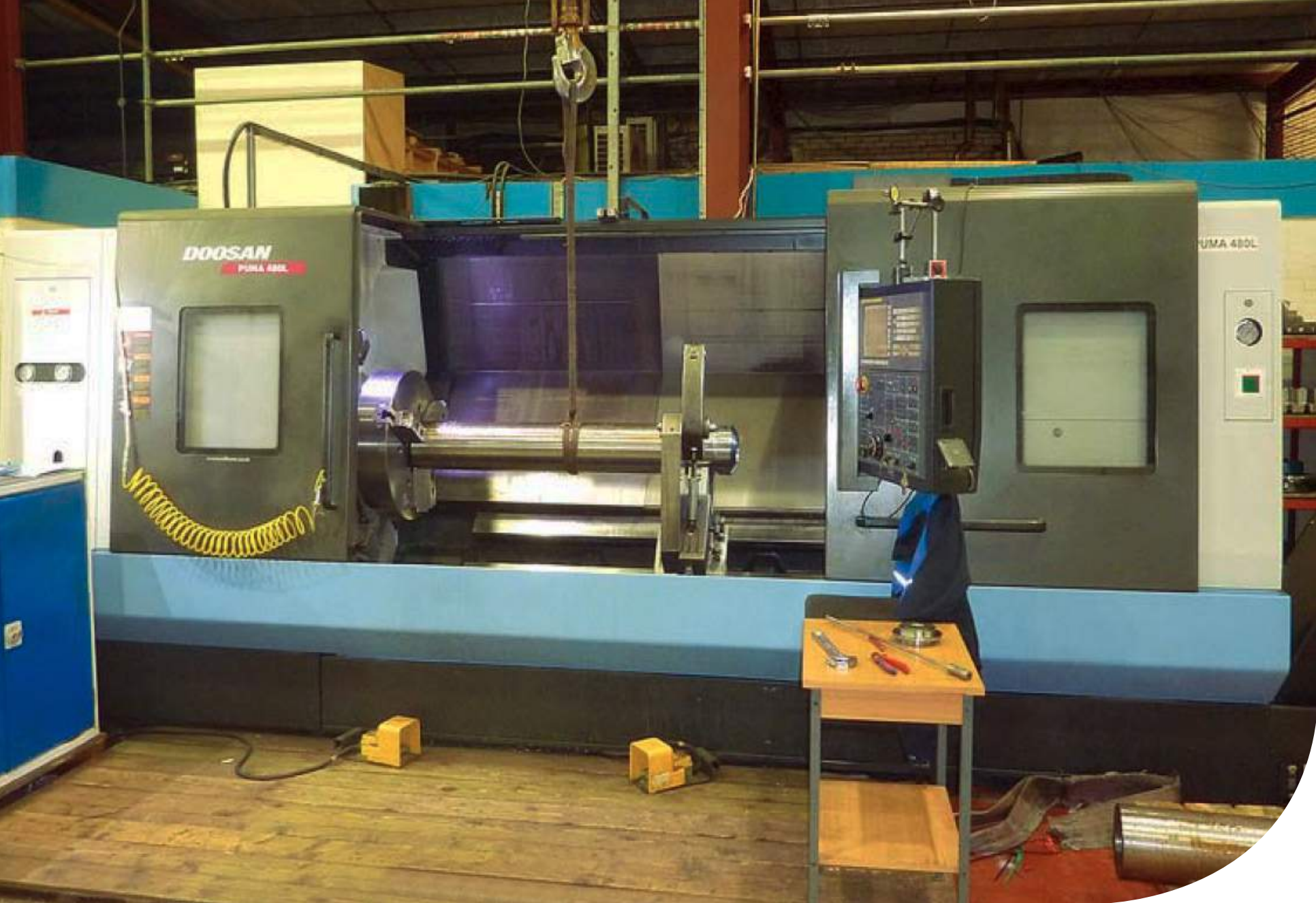
PUMA 480L | Horizontal Lathe