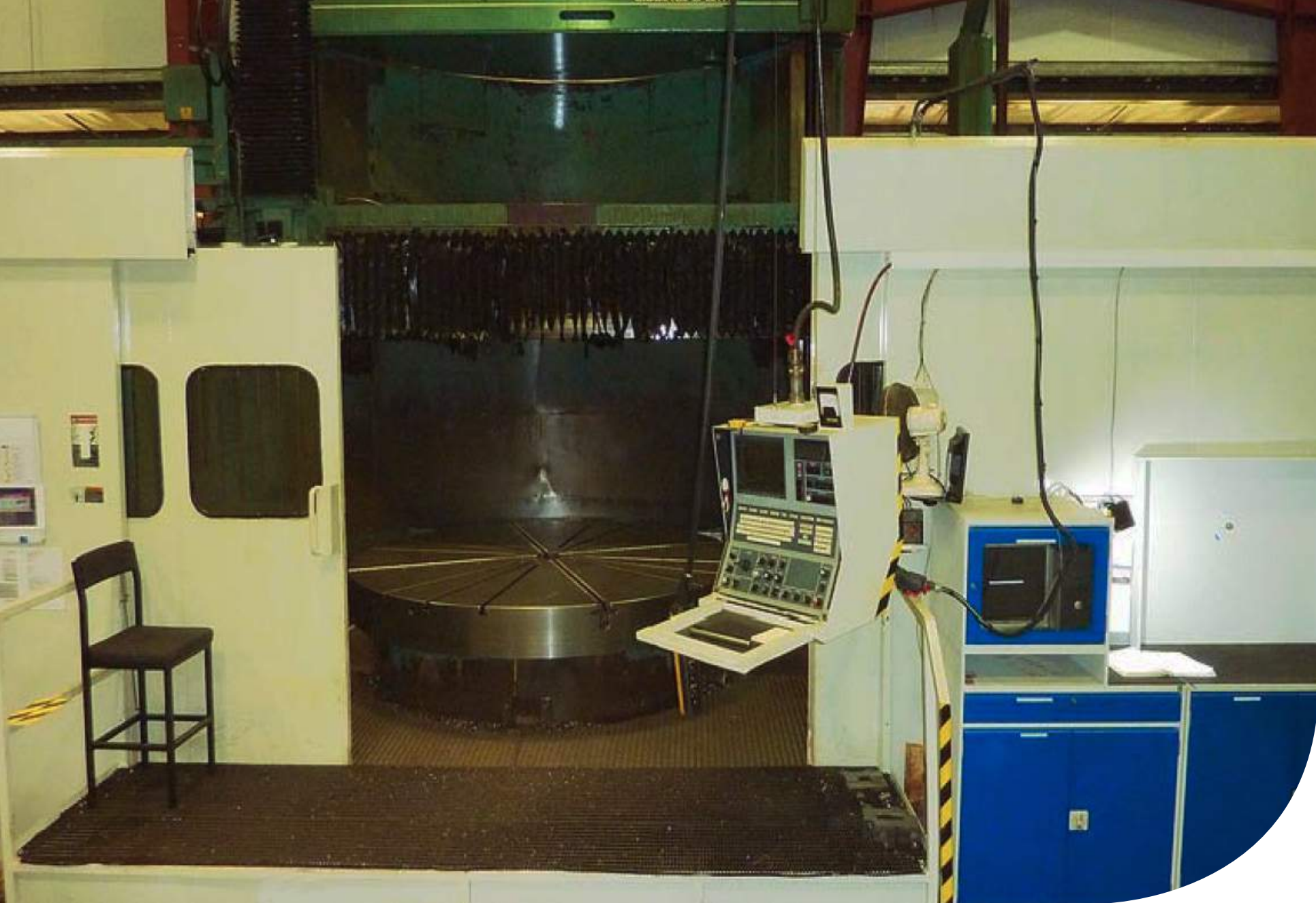
108" VTC | Vertical Turning Centre