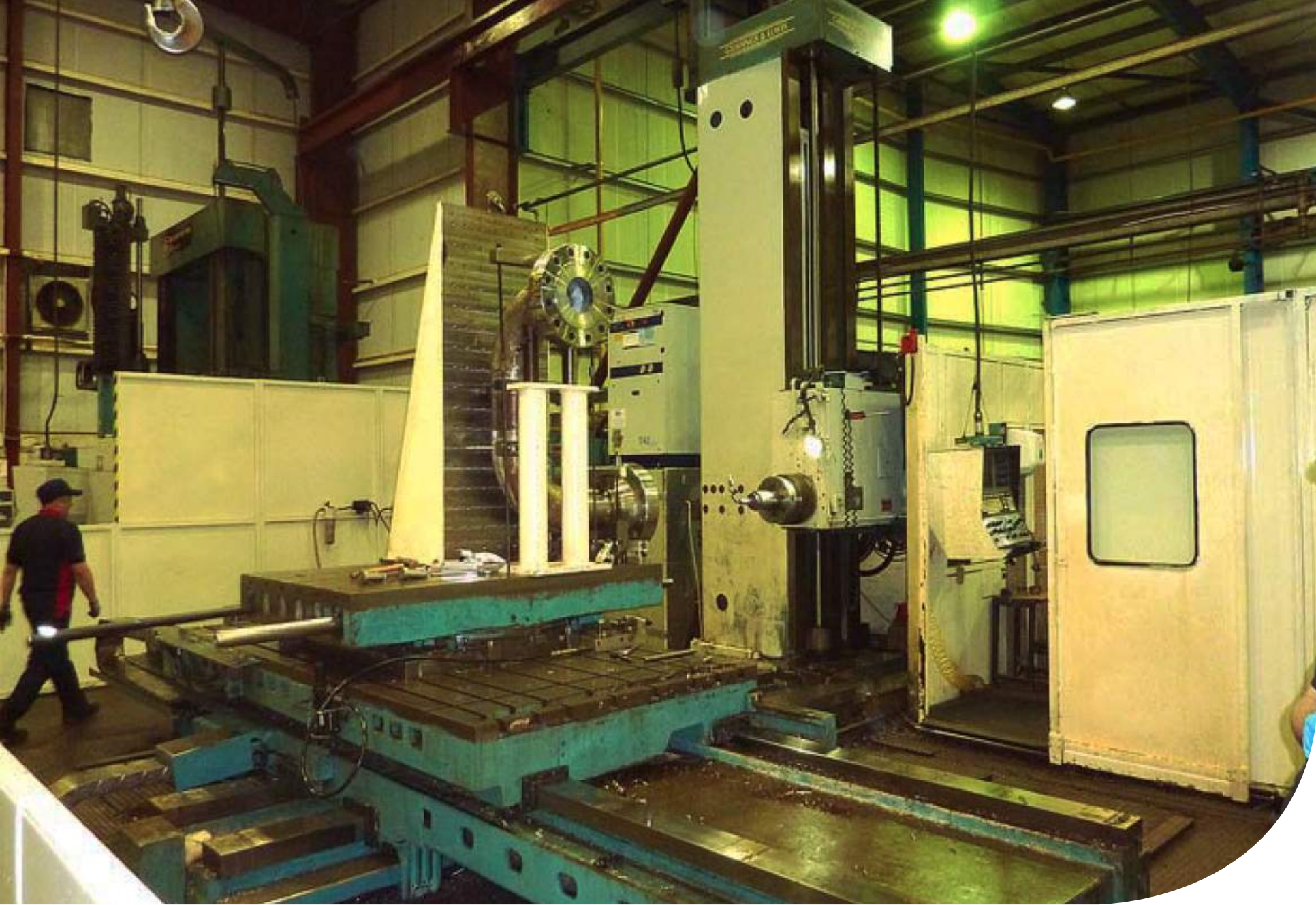
G50-1 | Horizontal Borer Large