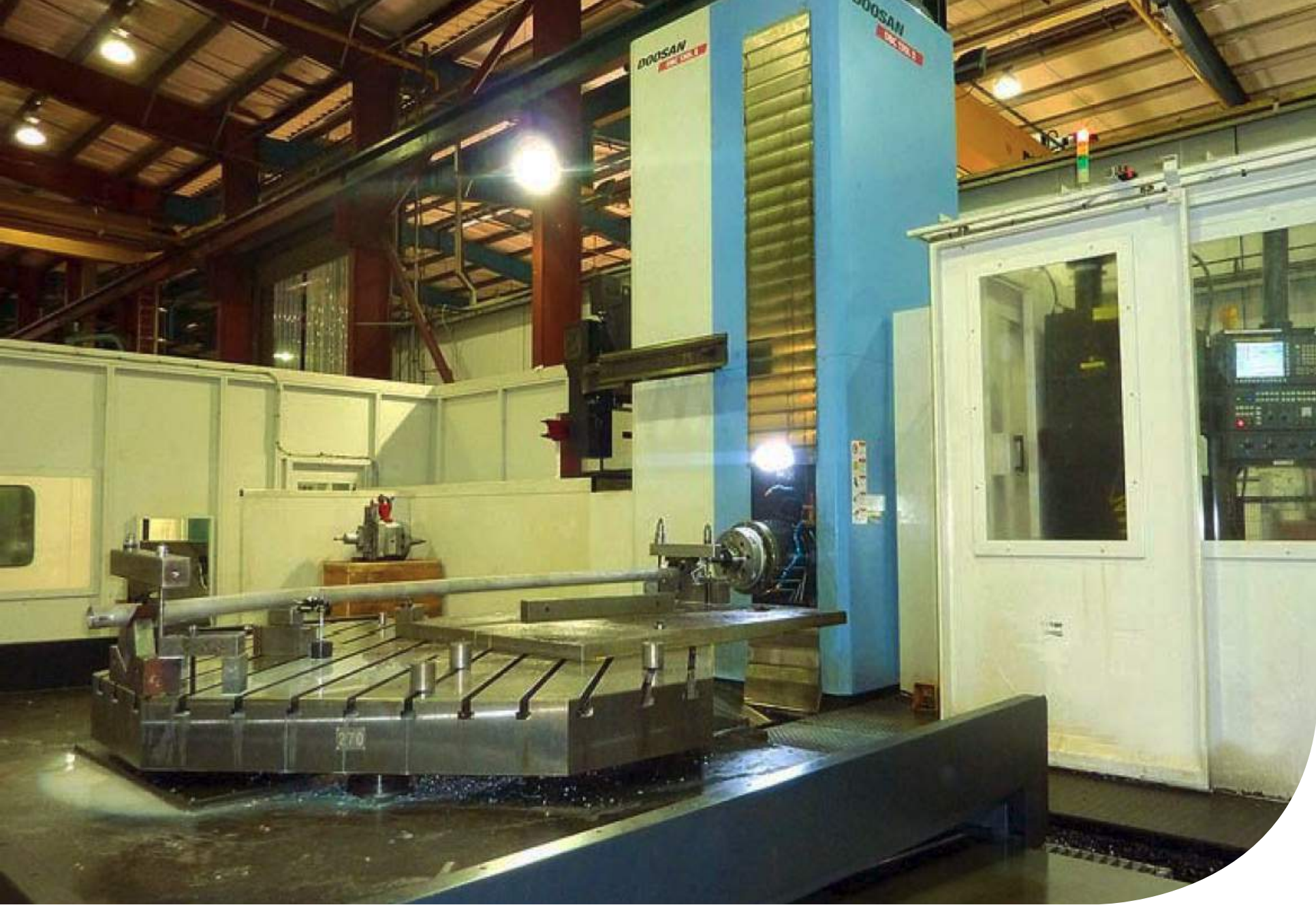
DOOSAN - 2 | Horizontal Borer Large