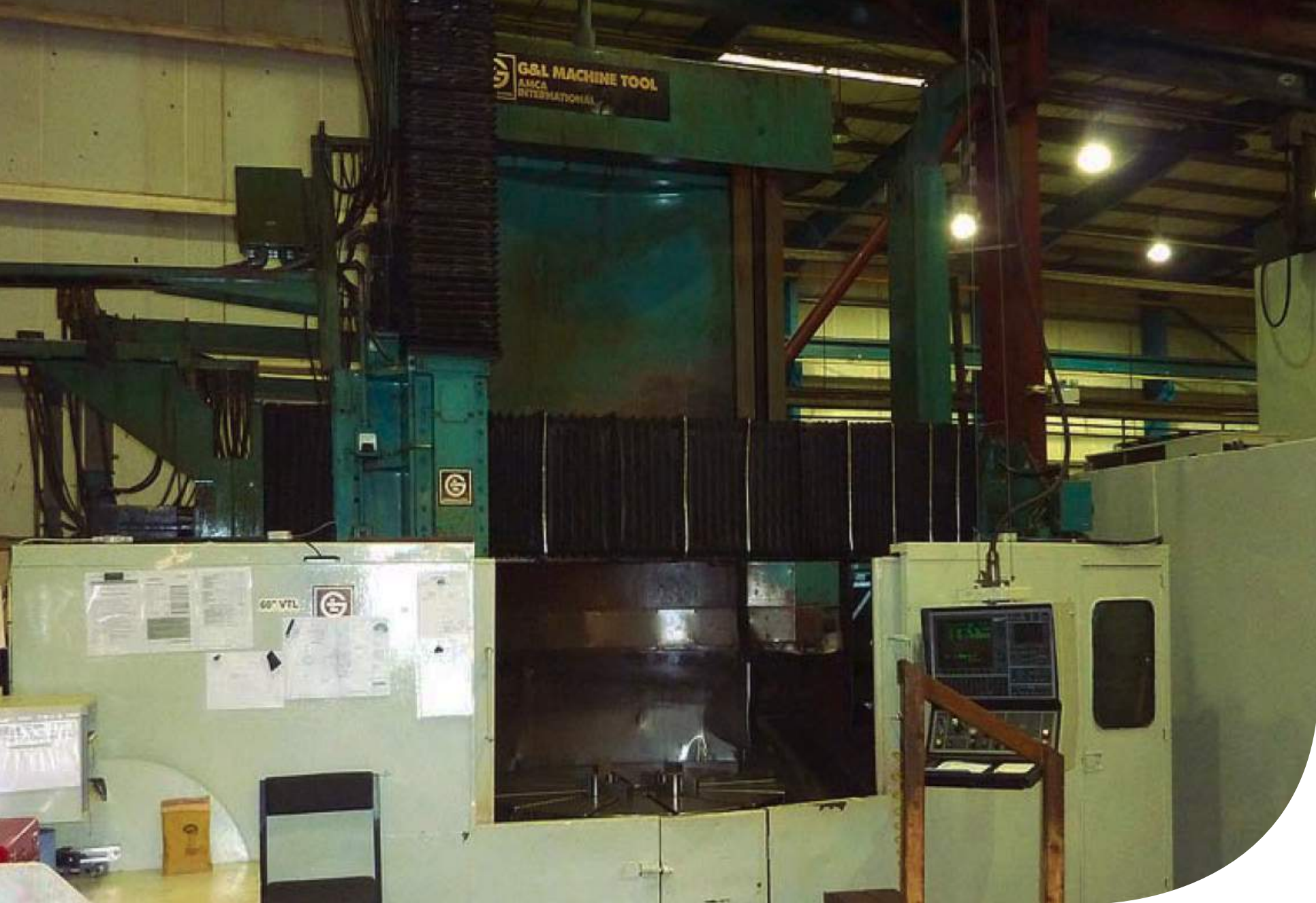
60" VTC | Vertical Turning Centre