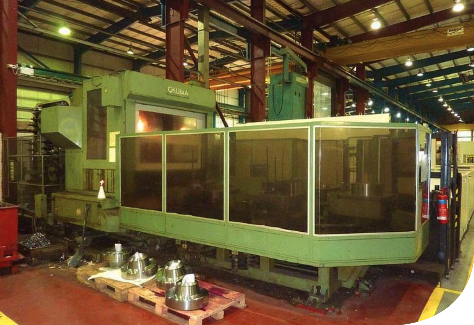
OKUMA-3 | 6 Pallet Machine Centre