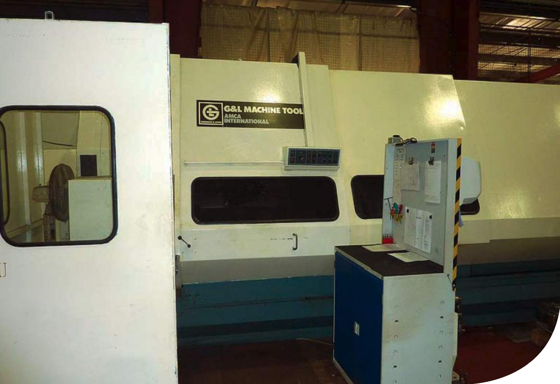
21U | Horizontal Lathe